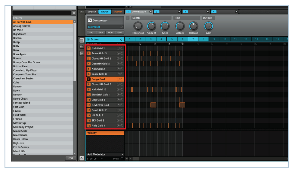
The Sound slot section on the software side of MASCHINE.

Tasks associated with Sounds/pads in the MASCHINE software.