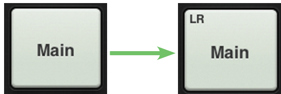
Old Master ID Button

Regardless of the name and/or image, a small name resides in the upper-left corner of the master ID button. This makes it easier to identify the output even after you change its name.