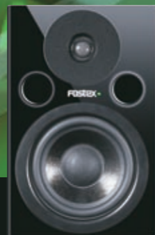
PM0.5 MKII 20mm tweeter 130mm woofer 70 watt bi-amplifier