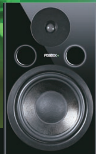
PM-2 MKII 25mm tweeter 200mm woofer 240 watt bi-amplifier

Fostex strive to design and build studio monitoring systems which enable you to experience your unique sound in all its dimensions. And through tireless research and development, endless measurements and real-world listening tests, Fostex's engineers have achieved this in the form of the beautiful second generation PM-Series. Capitalizing on Fostex's supreme knowledge of acoustics and speaker engineering, and now offering a brighter, tighter sound, these studio monitors are designed inside out to provide the best monitoring experience, with minimal resonance, sparkling highs and rich, deep lows. And, with new 'high-gloss' front baffles, they look as stunning as they sound.