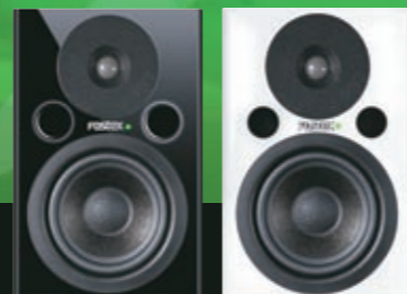
PM0.4 16mm tweeter 100mm woofer 36 watt bi-amplifier