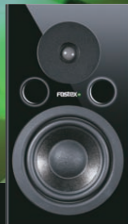
PM-1 MKII 25mm tweeter 160mm woofer 120 watt bi-amplifier