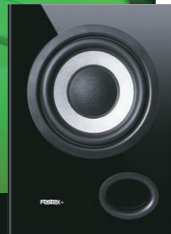
PM0.5-Sub MKII 200mm woofer 110 watt amplifier