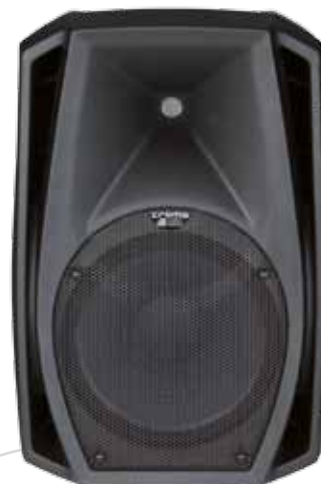
CR 12 club